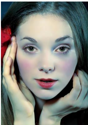
Porcelain Columbine , APradzynski