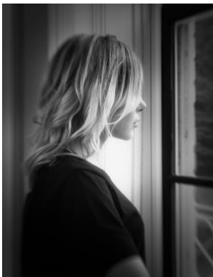
Pensive , GCorman

Sampler of Photography and Art Hung in 2022 FORMS, FACES & SPACES, figuratively speaking!