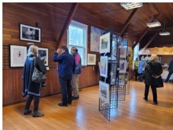
Gallery Visitors - 2022 exhibit