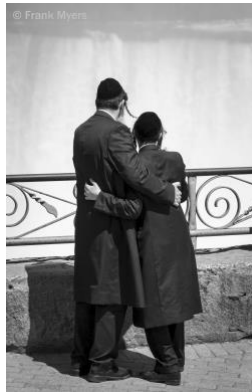
Father and Sn Niagara , FMyers