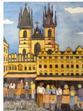
Old Town Square , GBackus